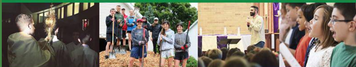
We are missionary disciples striving to lead all people to the Kingdom of God.