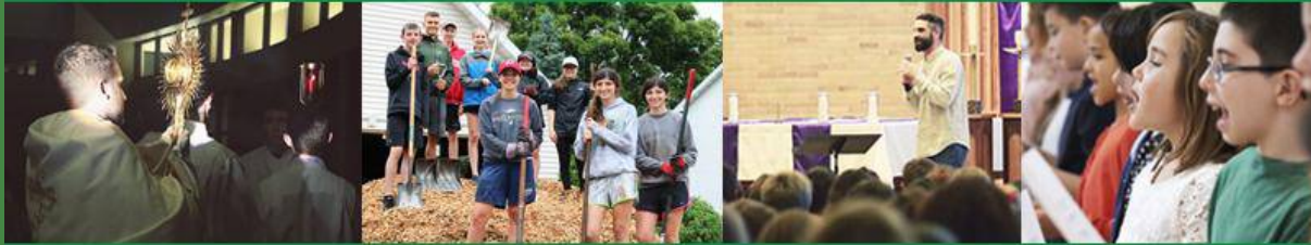
We are missionary disciples striving to lead all people to the Kingdom of God.