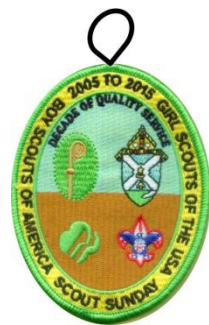
2015 Scout Sunday Patch

Patches are $3.00 each (includes shipping/handling) and can be ordered through the Education Department using this Order Form .